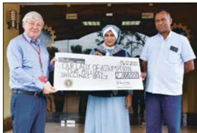
Making a contribution to Our Lady of Assumption Church, Walukuba for the construction of a care center for cancer and HIV patients