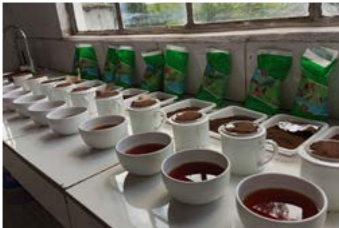
Different grades of tea brewing under controlled conditions in the tea tasting room