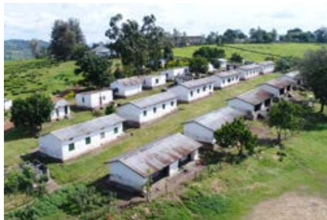
A block of workers' accommodation on the estate