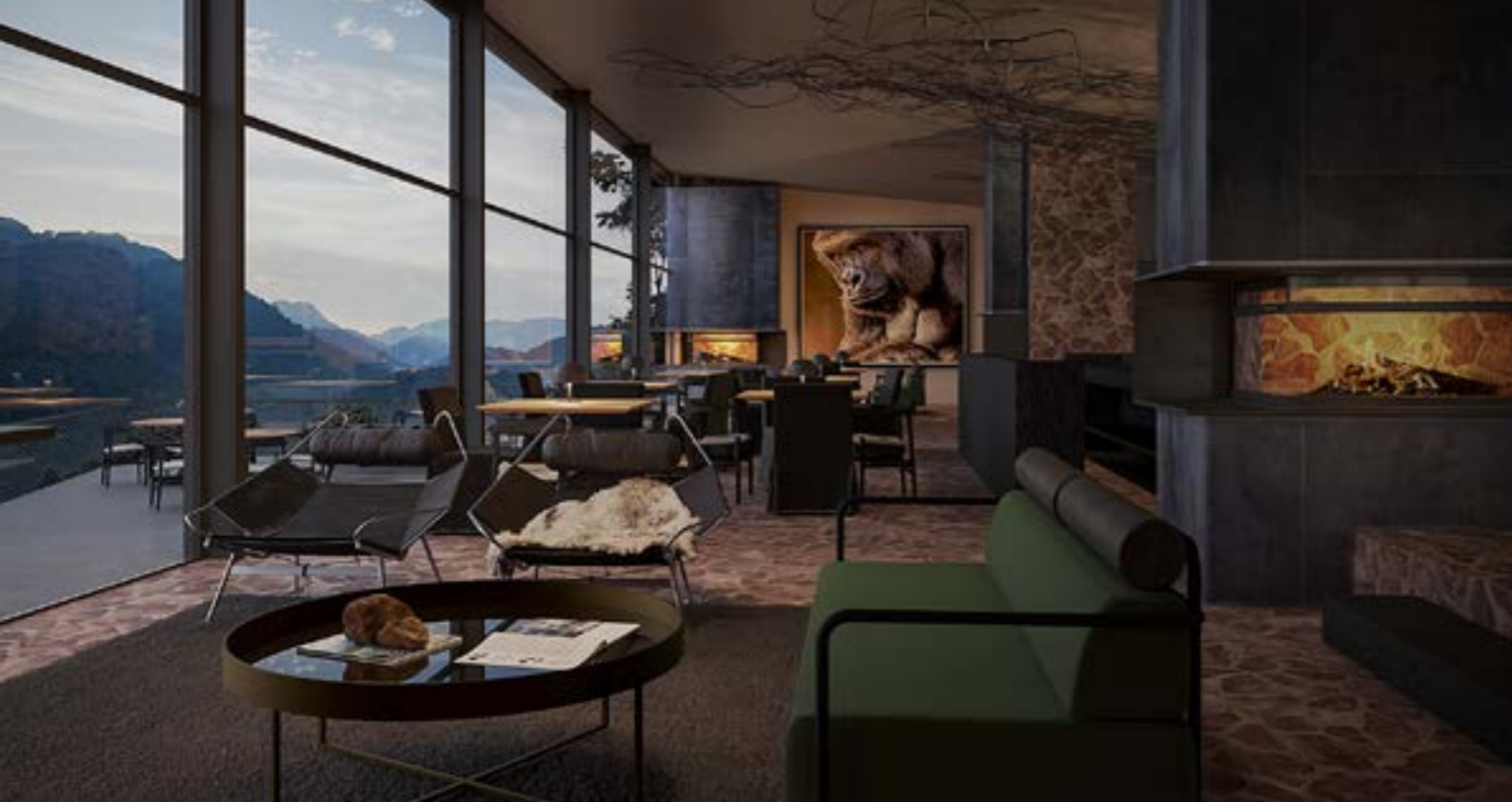
Proposed lounge area redesign, maintaining and optimising the magnificent mountain views