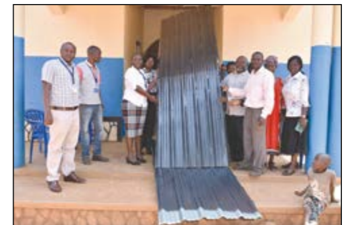
Donation of roofing sheets for the construction of Musima Church of Uganda