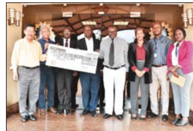
Contribution towards a reconstructive surgery training hub at Lamu Hospital