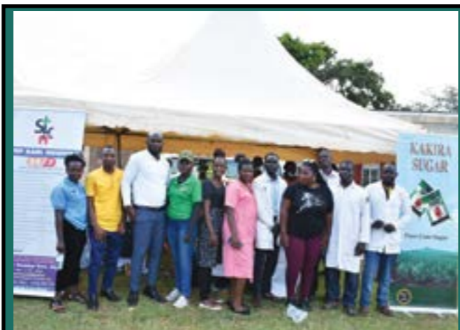
USING ART TO SAVE LIVES: Kakira Hospital staff pose for a photo with the founders and organisers of an HIV Awareness Concert. Kakira Sugar Limited participated and contributed to the event, which was held in Busede County where KSL has a large number of outgrowers.