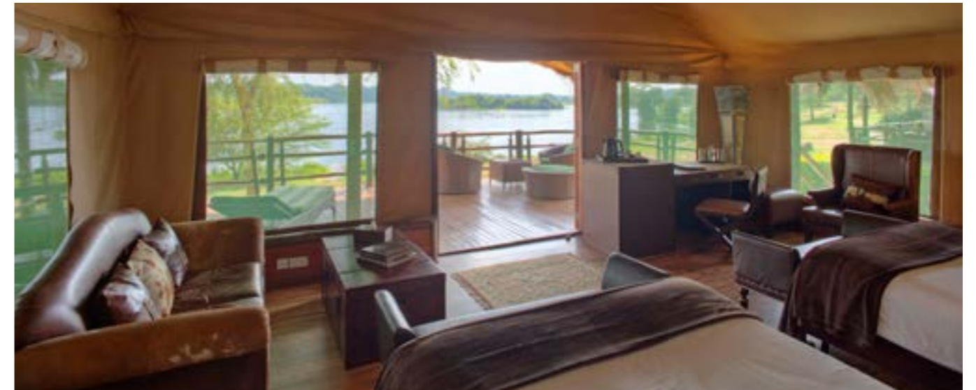
Above the external view of the tents Below, inside one of the tents, with a view overlooking the Nile

Marasa Africa remains committed to enhancing Chobe Safari Lodge with thoughtful touches to delight travellers. All the tents boast stunning views of the Nile River and an expanse of the Murchison Falls National Park.