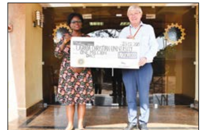
Contribution to helping needy students at Uganda Christian University