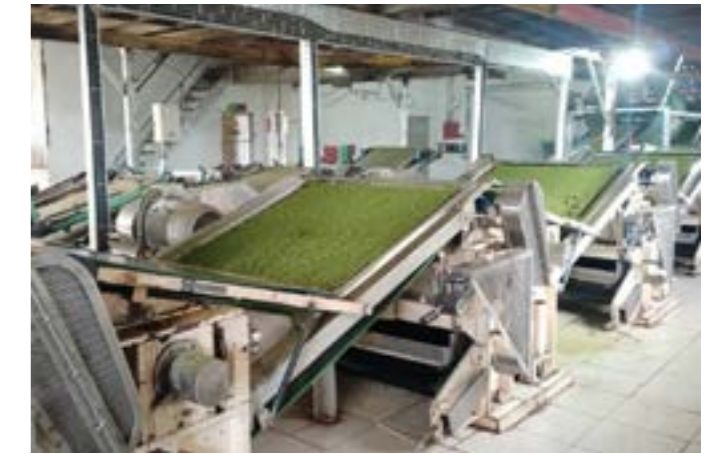
The new Rotorvane and CTC machinery