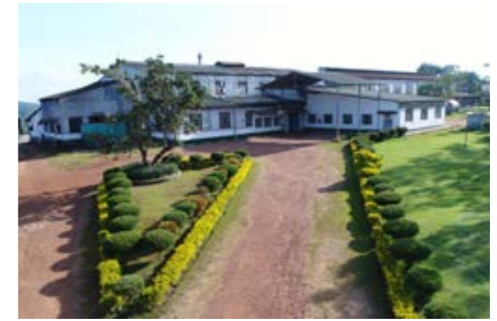
The Mwera tea processing plant

Mwera is also planting Eucalyptus trees every year to meet the factory firewood requirement. The natural forests crossing the estate are also maintained by the management, to create an eco-friendly condition in and around the Estate. Mwera has plans to plant 100 hectares of tea and 100 hectares of Eucalyptus, which project will be completed in a span of four years.