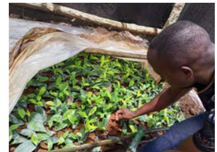
A few of the seedlings being prepared in the nursery