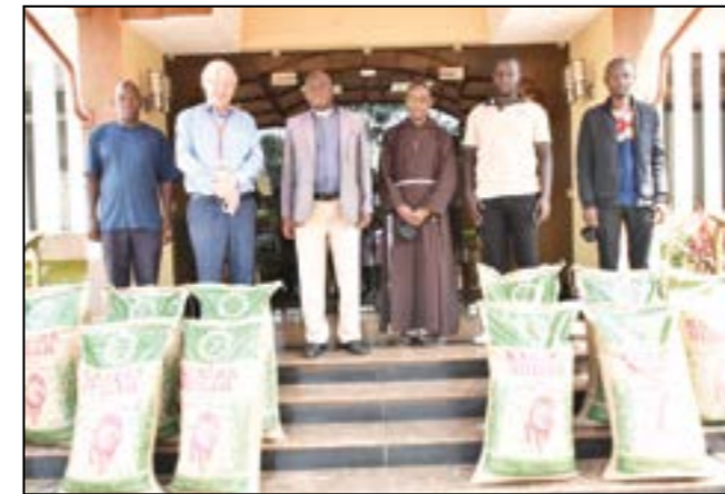
Christmas 2022 donations to St. Stephen and St. Theresia churches