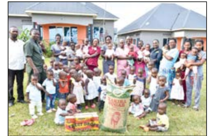
Staff and children of Son Rise orphanage receive quarterly donation items