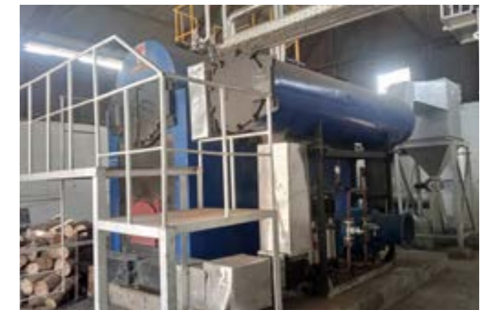
The new two-tonne IBR boiler