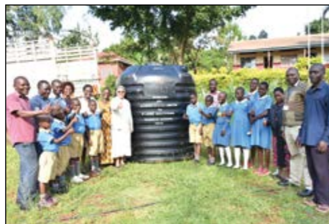
Delivering a 5,000-litre water tank to St. Jude Holy Cross Primary School