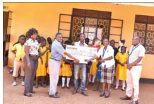
Handing over a cheque towards the repair of braille machines at Spire Road Primary School for the Blind