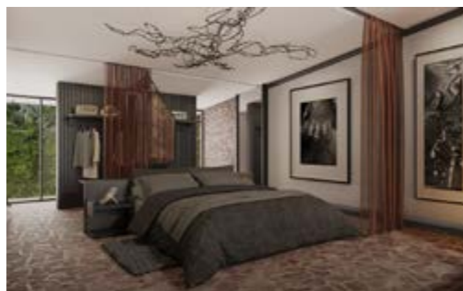
Interior guest room renderings