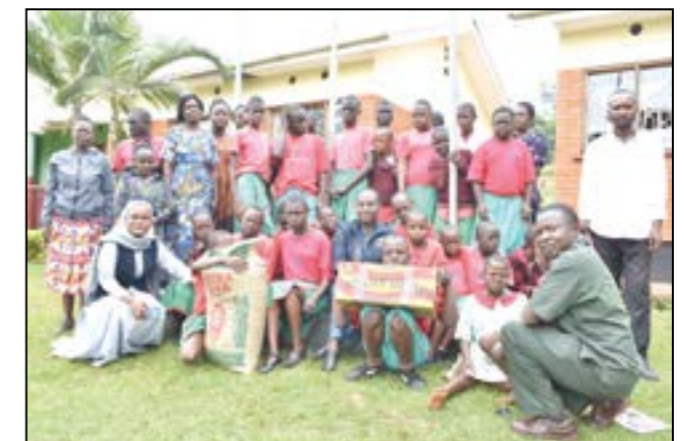
Delivering food items to St. Ursula Special Needs School