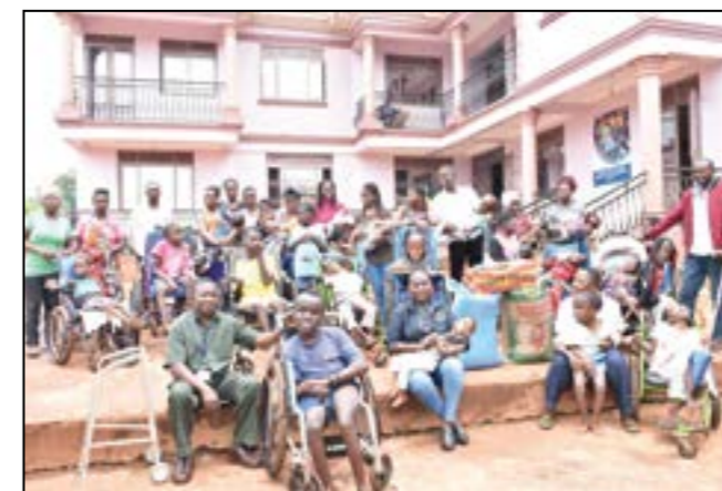
Delivering food items to Home of Hope, Wakitaka