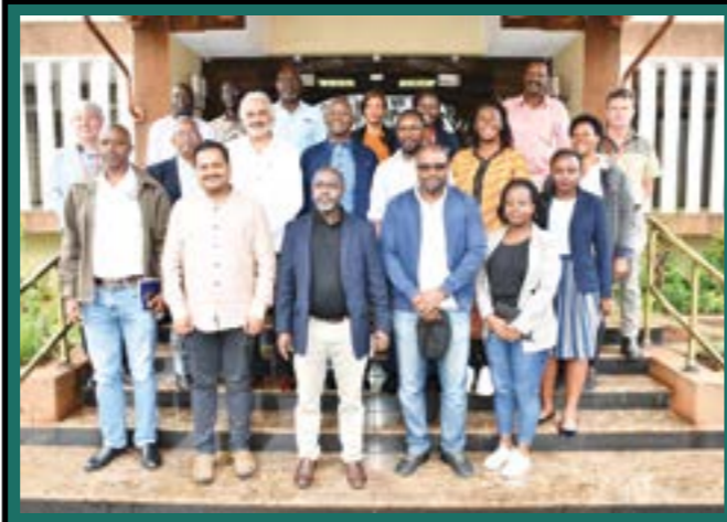
BUILDING INDUSTRY IN UGANDA: Members of the Uganda Manufacturers Association (UMA) visit Kakira Sugar Limited. UMA is an umbrella association that brings together Ugandan industrialists and manufacturers in an attempt to guide the industrial actors in the country towards global competitiveness