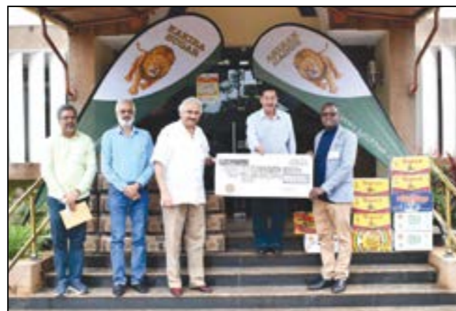
Christmas 2022 donation being handed over to the Mayor of Jinja City

We pledge to continue to offer our support and we encourage our friends and partners to do the same.