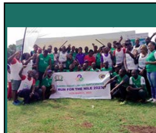
Kakira Sugar Limited employees participated in the Run for the Nile and Tree Planting at Wanyange in Jinja District as part of the activities to mark Uganda Water and Environment Week 2023 under the theme: Water and Environment for Climate Resilient Development. The 30 employees participated in the 5km, 10km and 20km marathons in Jinja City, and planted 100 trees at Wanyange as part of the company's contribution towards mitigating impacts of climatic change.