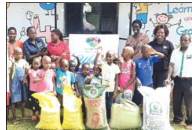
Delivering food items to UPENDO Children Ministries