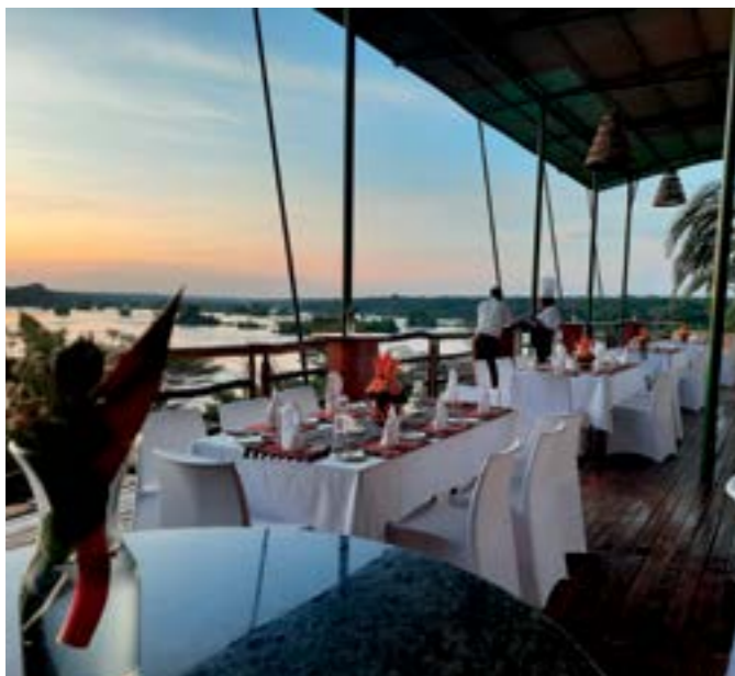
Chobe staff setting up for the dinner

Chobe Safari Lodge was honoured to host the Presidential CEO Forum's 3rd Bi-annual CEO Retreat in December, 2022. This is the largest national meeting of the private sector CEOs, with over 200 captains of industry, policy makers and investors coming together for discussions with the President of the Republic of Uganda. The impressive guest list included national ministers, dignitaries and industry leaders.