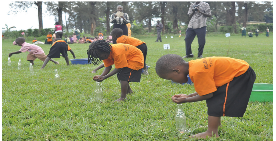
The Kakira community is so supportive when it comes to nursery school sports days (above). However, the older children also need parental encouragement

The benefits of encouraging your child into a sport can also make a huge positive impact on the rest of their life. It enables children to