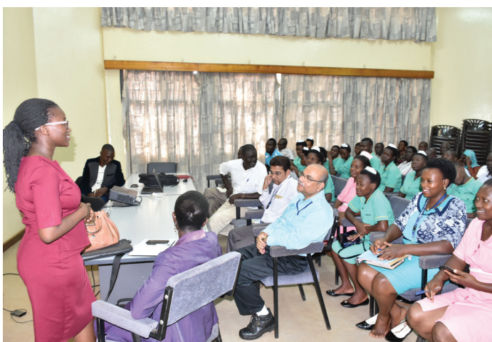
Hospital staff listening to a presentation on mental health during a training by a speaker from Minet, a pan-African risk advisory firm, 15th May, 2019