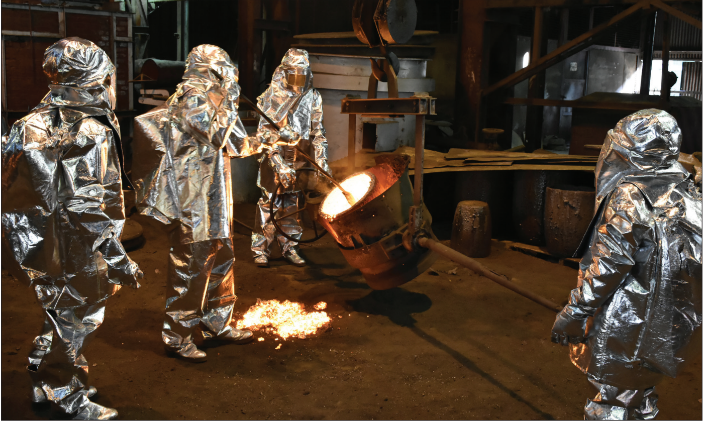
The foundry employees dressed in the protective heat suit which includes a helmet, body suit, gloves and boots

In April this year, the Foundry Workshop acquired new protective gear. The Heat Suit is an important part of their safety and protection measures, given the fact that Foundry employees work in an area that is subject to extreme temperatures and heat conditions.