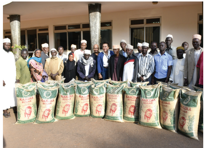
KSL donates bags of sugar to the Muslim community for Eid celebrations 07/06/2019