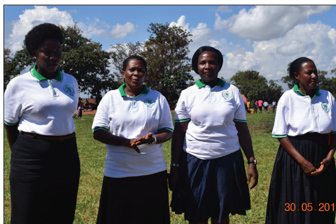
Members of the worker's union at Kakira