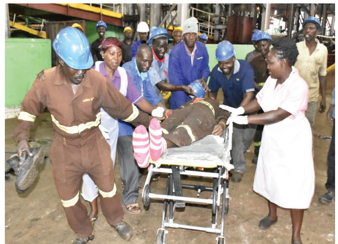
Fire training- a demonstration on how to handle a victim in case of an emergency - 31/05/2019