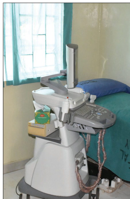
The newly refurbished and expanded medical store. Right, the new ultra sound scanner

In March Kakira Hospital unveiled a fresh face with the official commissioning of the new ultrasound scan machine and the refurbished medical store.