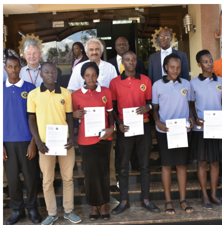
Group photo after the award ceremony awarded to biological dependants of KSL staff.

KSL initially awarded 400 million and is committed to contributing 200 million every year. Each year 30% of the scholarships will be