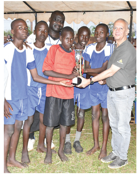
Participants and the winners at the recent Kakira estate primary schools handball competitions

Learning is a lifelong process, children learn about the world in many ways. But playing is one of the most effective ways children can learn about the world. Playing is so important to the development of a child that it has been recognized by the United Nations High Commission for Human Rights as a right of every child.