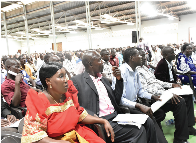
Participants during the Out growers Annual General Meeting held on 13/05/2019