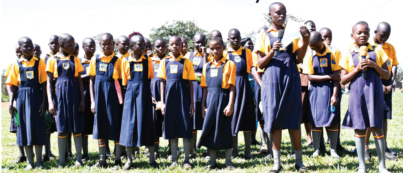
Pupils of Factory Primary School presenting a poem about Labour Day