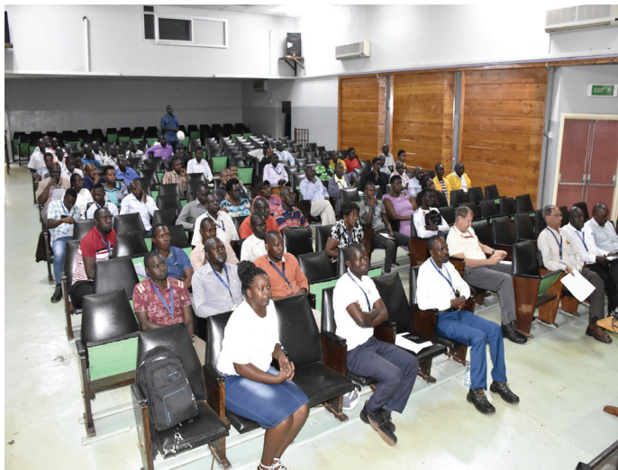
Participants during the 61 st SHE forum held on 27/02/2019