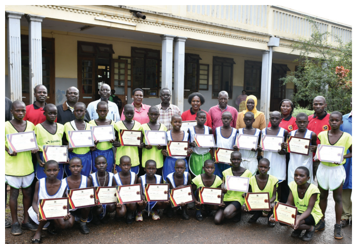
Pupils of the U14 team in Kakira Estate Primary School display certificates of participation in the Primary schools National Kids Athletics championship held from 5 th -14 th May, 2019 in Fort Portal, Kabarole District